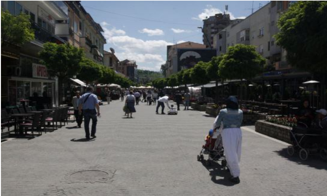
Pedestrian Street