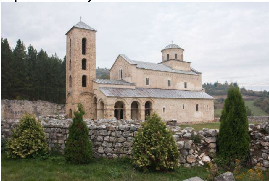
Sopoćani Monastery