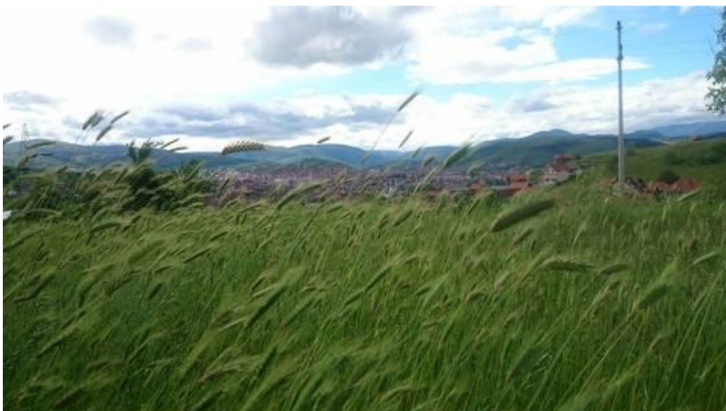
Hills around Novi Pazar