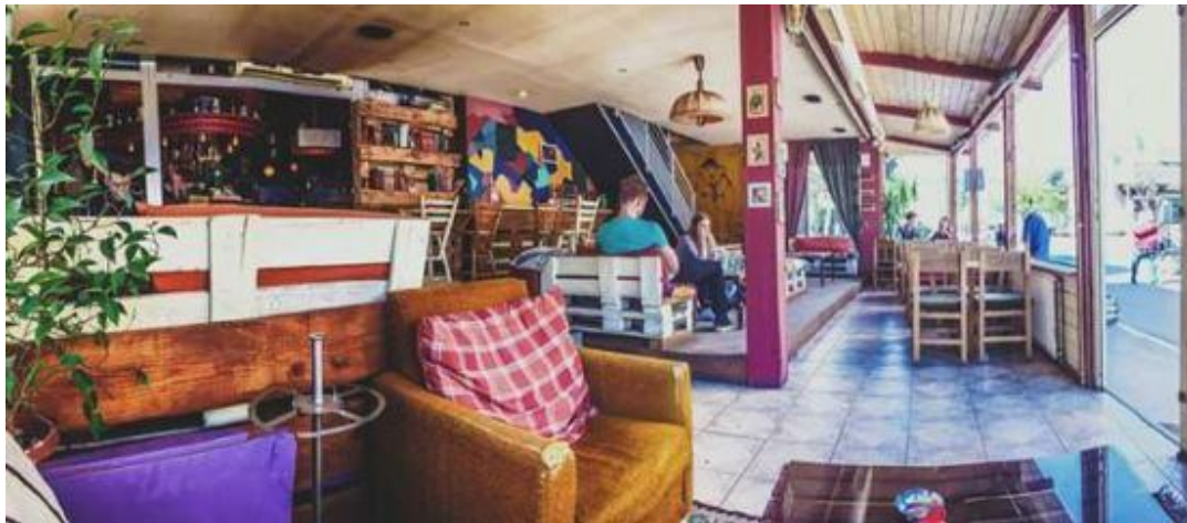
Jazzva Courtesy of Jazzva