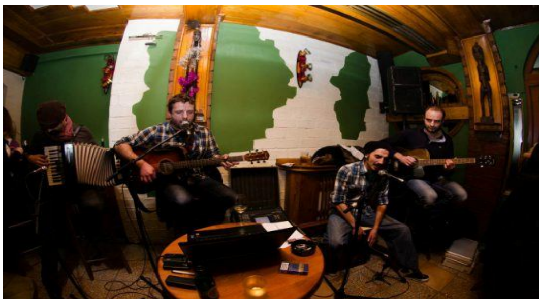
Live music at Studio Dory