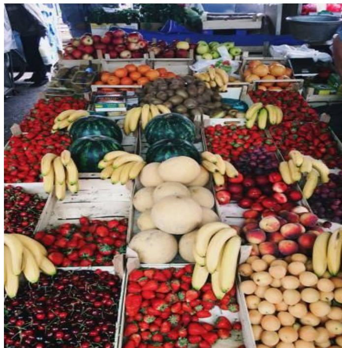
Green Market