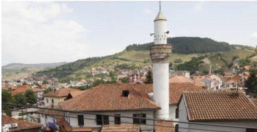
Arap mosque