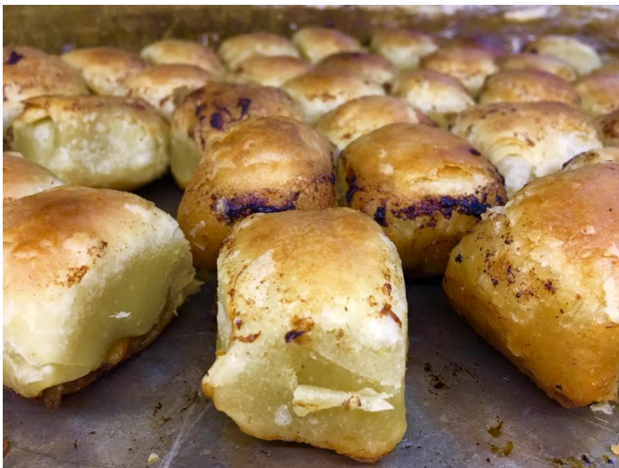
Mantije at Sidro